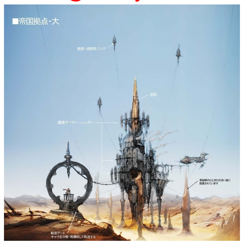
* \( \) New Concept Art for the Imperial Stronghold

From a programming standpoint, the multi-tiered code used in the current UI system has become overly complex, preventing us from making the improvements we have planned.